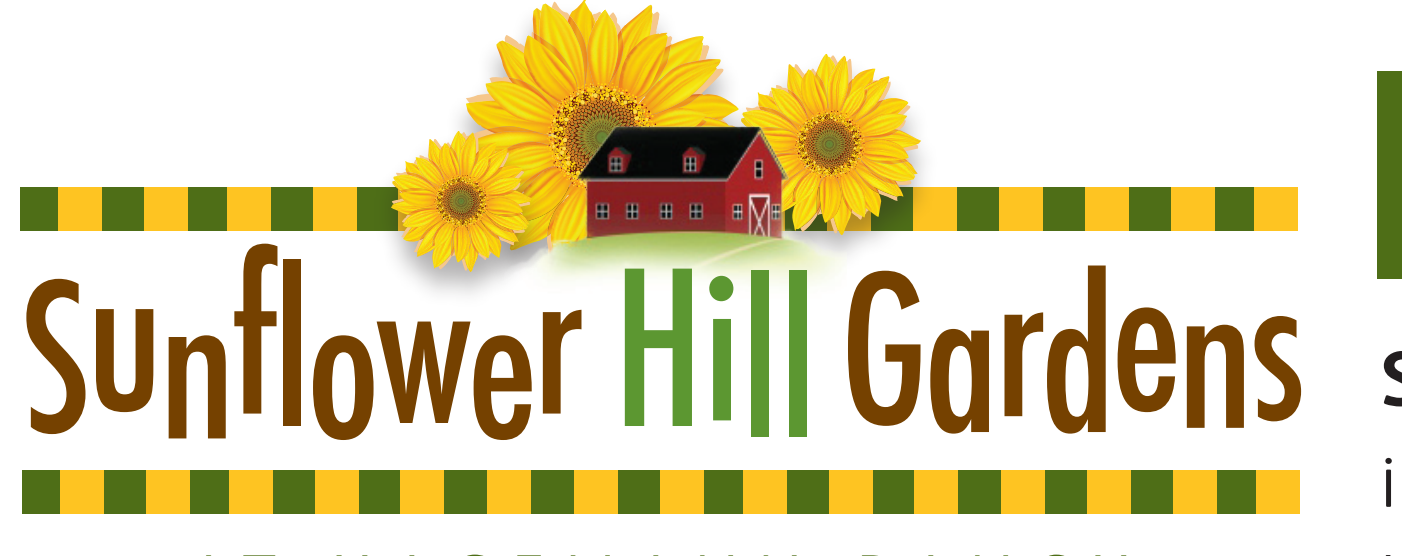
AT HAGEMANN RANCH