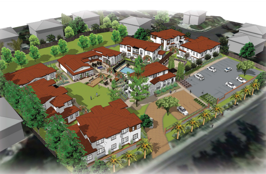
SITE PLAN ILLUSTRATION

And Join Us for a Pancake Breakfast and Egg Hunt