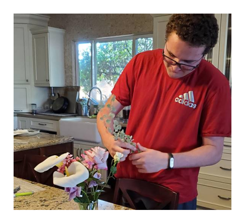
Program Participants Engage in our Online Activities