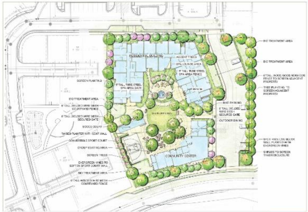
STREET VIEWS + CONCEPTUAL LANDSCAPE PLAN

SUNFLOWER HILL - IRBY RANCH | PLEASANTON, CALIFORNIA SUNFLOWER HILL | SATELLITE HOUSING