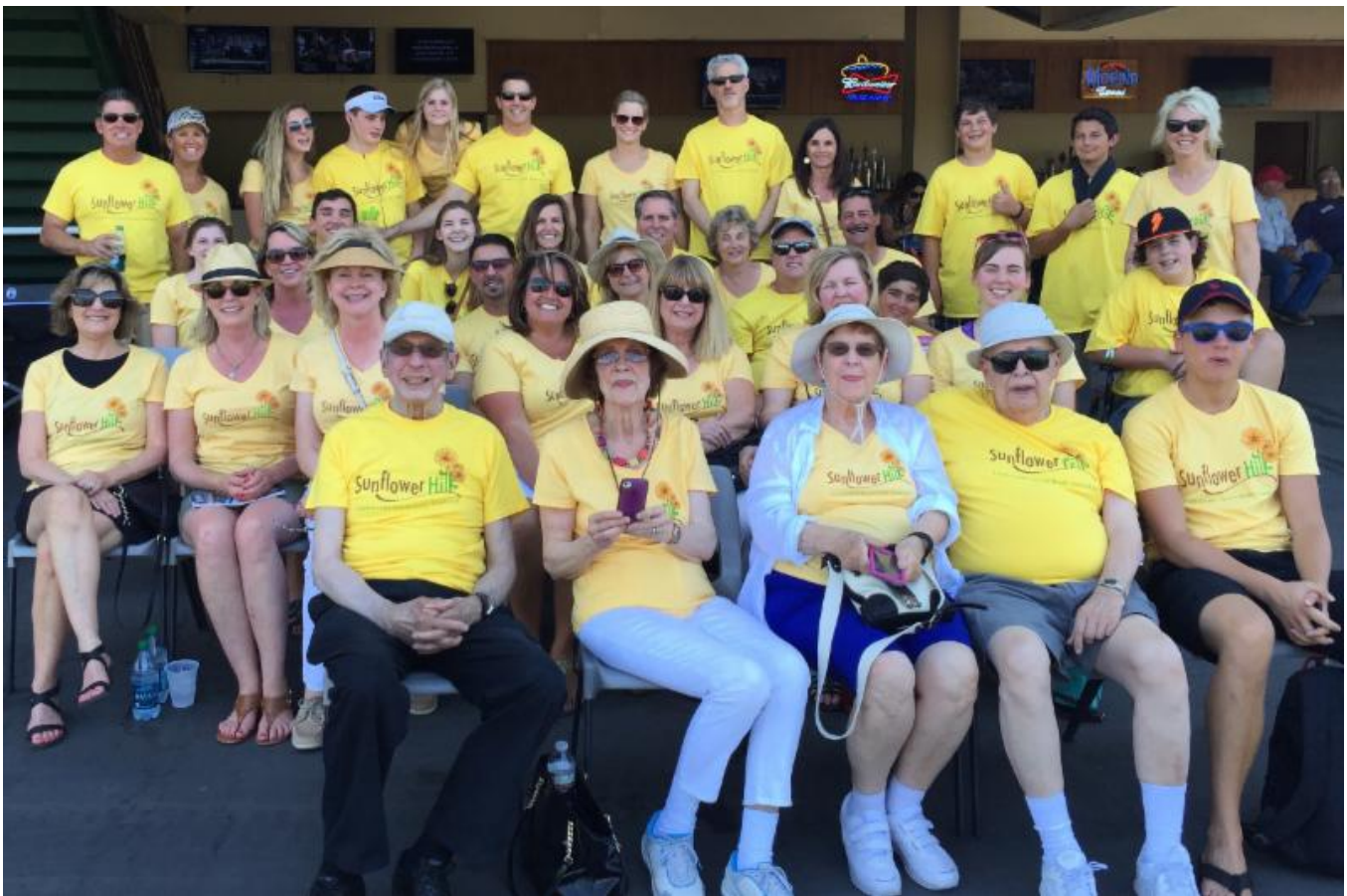
A Gardener at Birth...