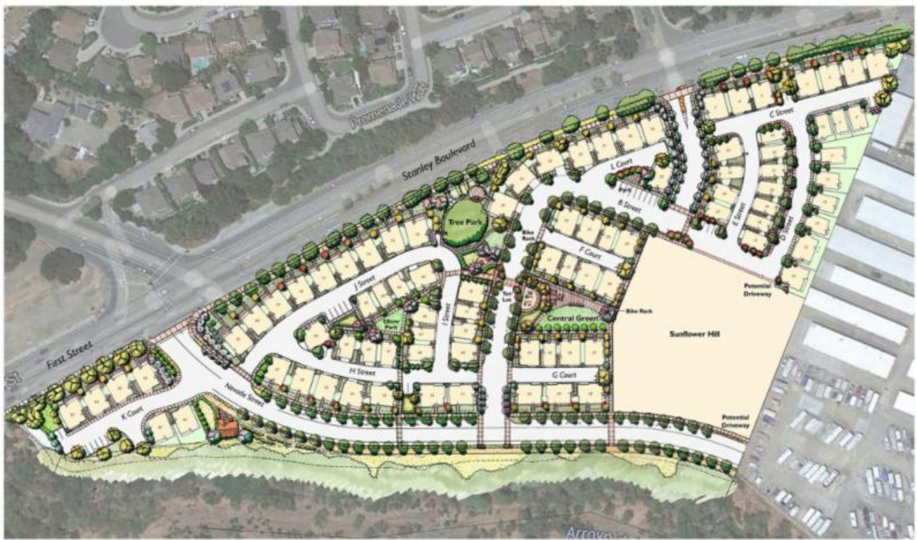
Sunflower Hill at Irby Ranch