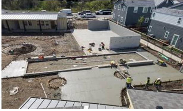
Bocce Ball Court