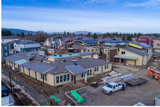
Sunflower Hill at Irby Ranch