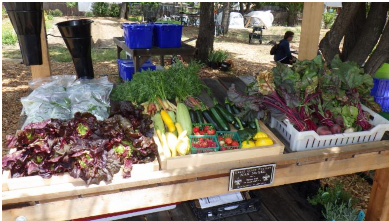
Just harvested produce displayed on our new produce stand built by Max McGee!

The Sunflower Hill Gardens are flourishing! In April we planted most of our garden produce, which was the main focus of the April Special Needs Family Workday. Much of this produce planted in April is now ready for harvest.